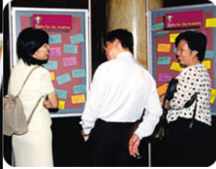
Principals discussing more ideas for the Academy.

"Leadership is not something that you learn once and for all. It is an ever-evolving pattern of skills, talents, and ideas that grow and change as you do."